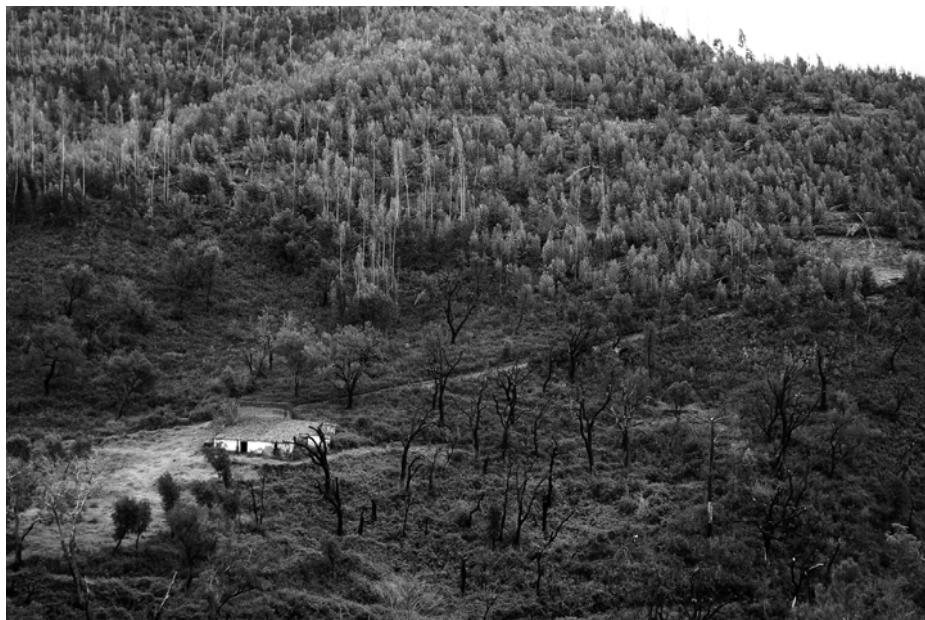
Figure 2. Different recovery rates of tree species three years after a wildfire in the south of Portugal. At the top, the higher recovery rate of eucalyptus, at the bottom, low recovery rate of cork oaks.