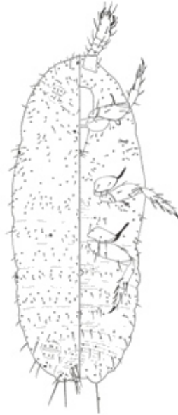
Figure 4. Ripersiella multiporifera third-instar nymph.

Diagnosis: The third-instar female can be distinguished most easily from the adult female by lacking a vulva and multilocular disc pores, from the first instar by the presence of dorsal bitubular ducts, and from the second-instar nymph by the presence of several setae and triloculars on the sclerotized lips of the ostioles and the number and position of dorsal bitubulars.