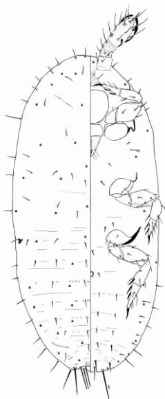
Figure 2. Ripersiella multiporifera first-instar nymph.

Setae on abdomen in six rows; on segment I-VI 11-14 \mu\text{m} long, on segment VII 16-19 \mu\text{m} long. Labium 50-53 \mu\text{m} long. Clypeus 46-50 \mu\text{m} wide. Ratio of body width to width of clypeus 4.0-5.1. Cephalic plate present but occasionally invisible, with 3-4 setae. Trilocular pores present on the margins or submargins of abdominal segments. Posterior spiracle with long muscle plate; length 20-22 \mu\text{m} , peritreme 3-3.5 \mu\text{m} wide. Tubular ducts, bitubular ducts, multilocular disc pores and eyes absent.