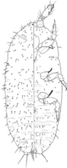
Figure 3. Ripersiella multiporifera , second-instar female.

II and segment VII of the abdomen. Abdominal segment I with 11-14 setae and 9-12 triloculars; segment III with 10-14 setae and 9-12 triloculars, segment VI with 7-9 setae and 4-9 triloculars.